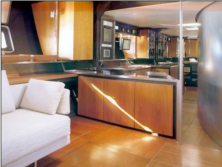
Saloon / Nav. Area