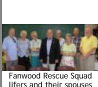
Fanwood Rescue Squad lifers and their spouses