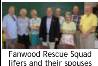
Fanwood Rescue Squad lifers and their spouses